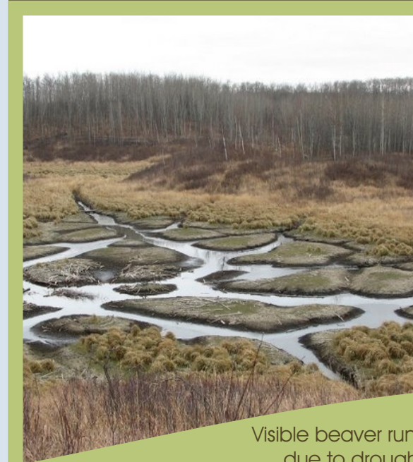
Visible beaver runs due to drought

Data sharing and access for regional land use planning and ongoing land management